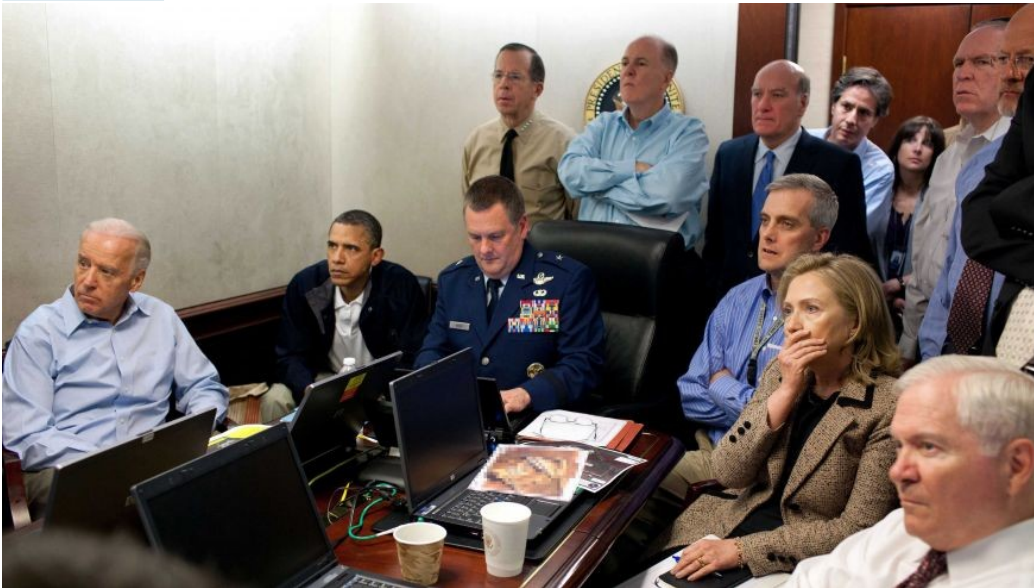
May 1: Secretary of State Hillary Rodham Clinton, President Barack Obama and Vice President Joe Biden, along with with members of the national security team, receive an update on the mission against Usama bin Laden in the Situation Room of the White House.