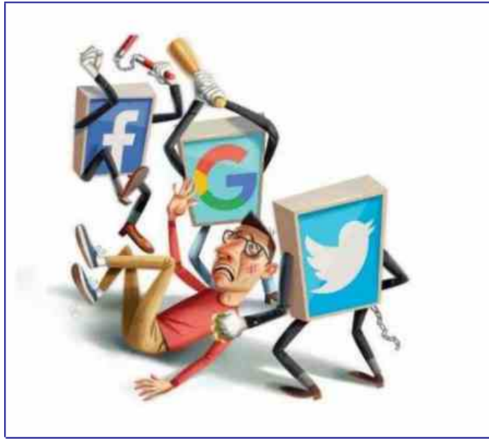
The Silicon Valley Cartel