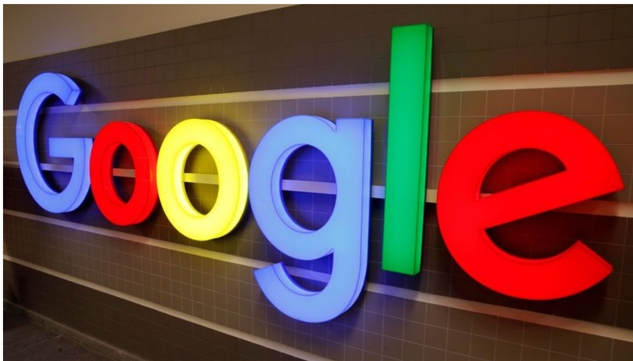
FILE PHOTO: An illuminated Google logo is seen inside an office building in Zurich, Switzerland December 5, 2018. REUTERS/Arnd Wiegmann