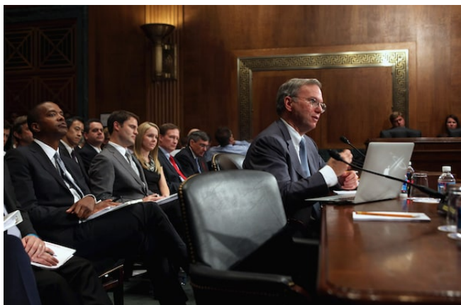
Google Executive Chairman Eric Schmidt testifies before a Senate Judiciary antitrust subcommittee in September 2011.

Days earlier, Schmidt had endured a rare and unnerving appearance on Capitol Hill, where he was lectured by a Republican senator who accused the company of skewing search results to benefit its own products and hurt competitors. The FTC antitrust inquiry was underway. And, in what Google saw as a direct threat to the open Internet, major lobbies such as the U.S. Chamber of Commerce and the Motion Picture Association of America were mounting a legislative campaign to place restrictions on the sale of pirated music and movies. The effort was getting bipartisan traction in the House and the Senate.