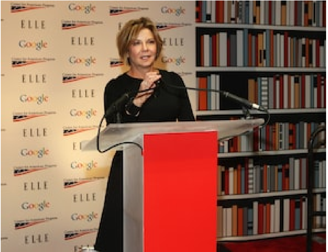
Susan Molinari, a Republican former congresswoman from New York, works as Google's top lobbyist in Washington.

Molinari added, "We support associations and third parties across the political spectrum who help us get the word out — even if we don't agree with them on 100 percent of issues."