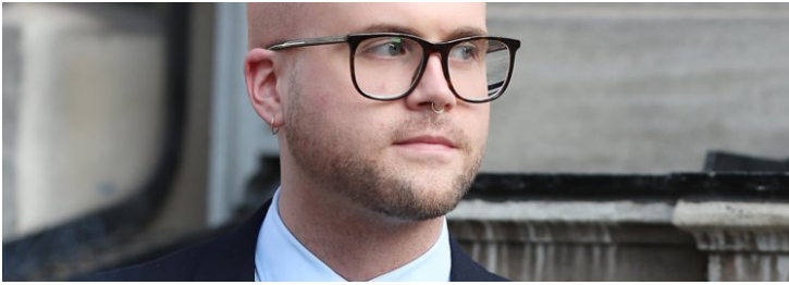
Christopher Wylie.

Prior to going public in March, which he did through interviews with The Observer and The New York Times , Wylie said he was a private person. Now, his shock of pink hair, nose ring, and countless media appearances have made him an easily recognisable figure.