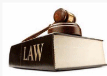
MULTIPLE LAW FIRMS AND INVESTIGATORS