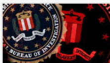
MULTIPLE FEDERAL LAW ENFORCEMENT ENTITIES