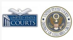
THE U.S. FEDERAL COURTS