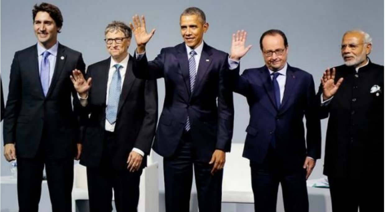
Canadian Prime Minister Justin Trudeau, Microsoft co-founder Bill Gates, Former US President Barack Obama, French President Francois Hollande and Indian Prime Minister Narendra Modi at the Paris Climate Conference in 2015.

After rising by 0.113C per decade between 1950 and 1999, temperatures appeared to have stabilized between 2000 and 2014, despite rising levels of CO 2 emissions, which climate change scientists said were responsible for the earlier warming.