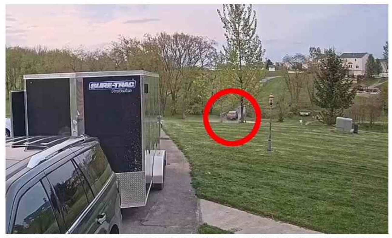
A Tesla Cybertruck crashed into a neighbor's home just four hours after its new owner took possession, with the brakes reportedly malfunctioning. Surveillance footage shows the $109,000 vehicle speeding down a driveway, screeching around a bend, and smashing into the house.