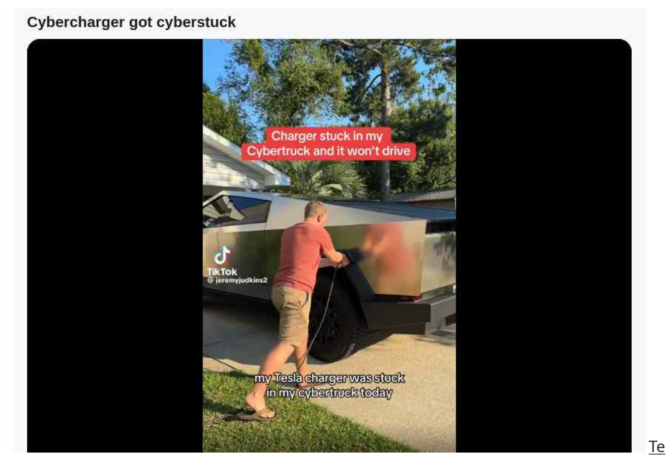
sla's new bulletproof 'Cybertruck' is another Musk lie Tesla s new bulletproof Cybertruck is another Musk lie