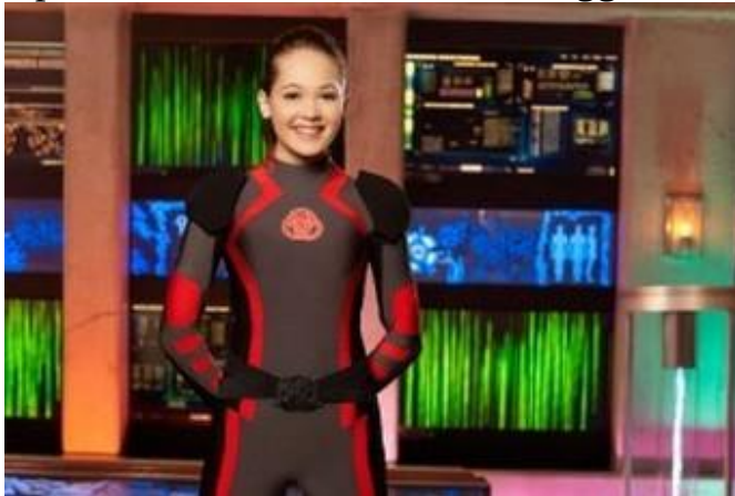
Kelli Berglund was the star of Disney's "Lab Rats."

Thorne as CeCe Jones in a 2011 episode of Disney Channel's "Shake It Up" Modal Trigger