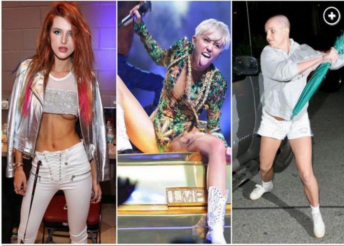
Bella Thorne, Miley Cyrus in 2014 and Britney Spears in 2007.