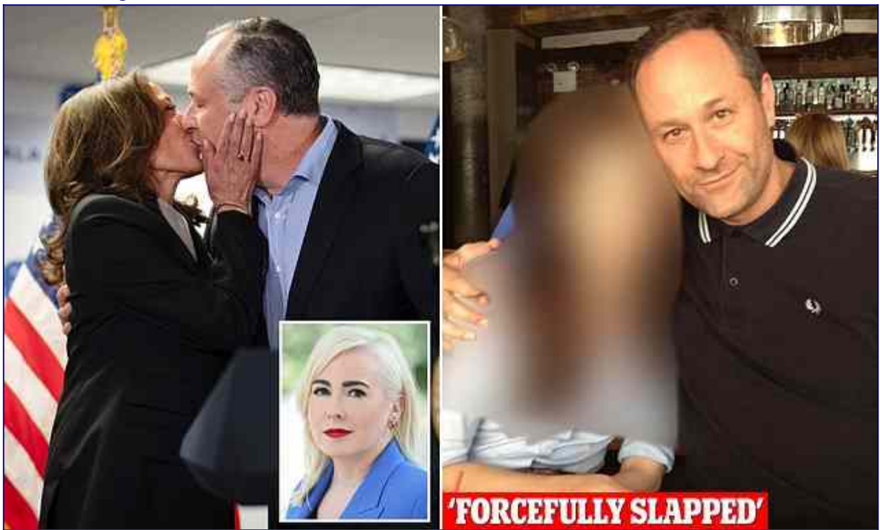
How can Kamala stay silent now her hubby is accused of hitting his ex? 19.1k viewing now