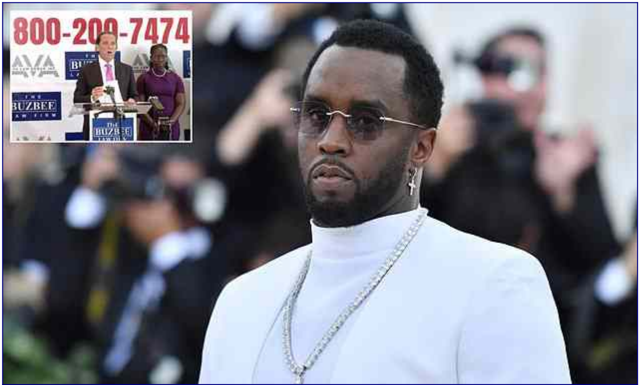
Diddy accomplices includes 'powerful execs, bankers,' says lawyer 68.1k viewing now