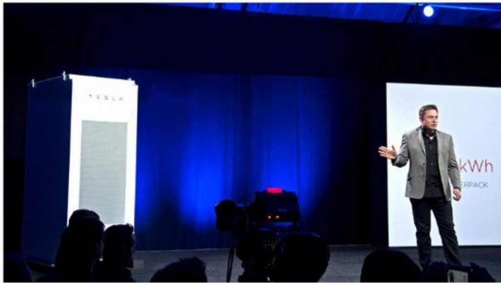
During an event at Tesla's design studio in Hawthorne, Elon Musk introduces a line of batteries for homes and businesses.