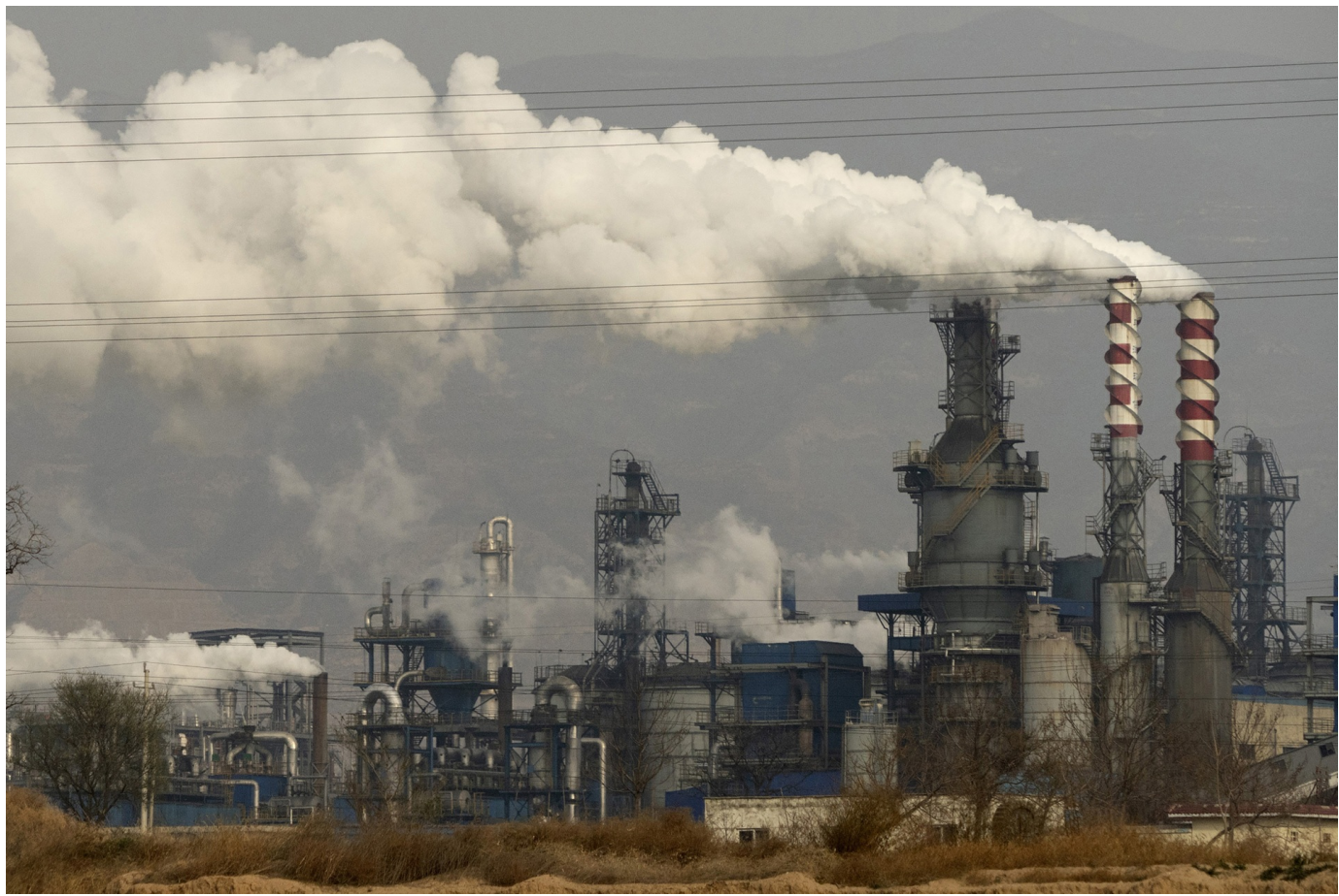
Smoke and steam rise from a coal processing plant in Hejin in central China's Shanxi Province on Nov. 28, 2019.

So what's the Biden administration doing about this coaling up? Nothing! (Unless you count waiting a week before shooting down an intruding Chinese balloon as something.)