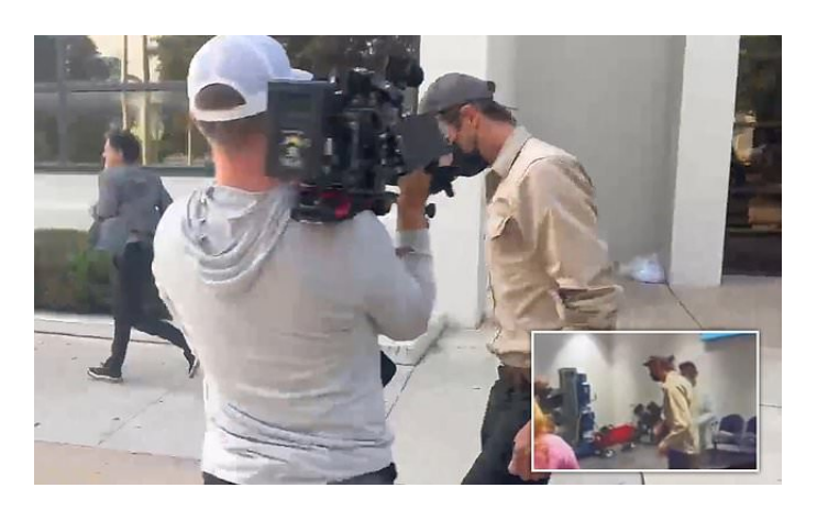
Boyfriend of 'killer' yoga teacher STAMPS on cameraman's foot