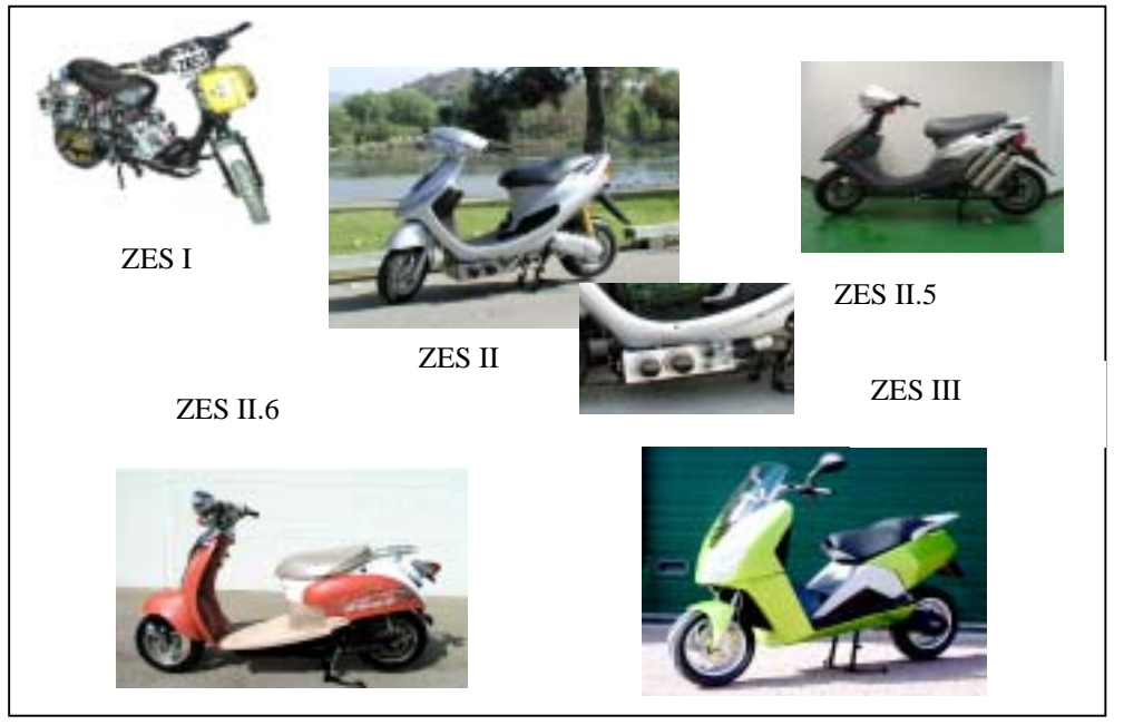
Figure 1. Fuel Cell Scooters

The creation of the commercial model of fuel cell scooters, ZES IV, and a factory for fuel cell engines is projected to commence in 2004. When annual output reaches 100,000 scooters, the estimated selling price for each fuel cell scooter will be about US$2,200. As output doubles, the estimated price will drop to about US$1,730, roughly the current market price of a 125 c.c. scooter. The scooter's design and performance will be comparable to conventional gasoline engine scooters and it will be competitively priced. (APFCT, 2002)