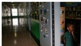
Schools Ring Closing Bell