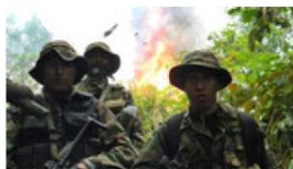
Brazil Reaches Across Border in Drug Battle