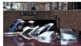
Breaking the Glass for Automobile Sales