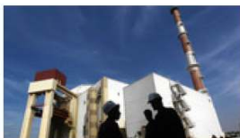
U.S. Steps Up Spying on Iran Reactor