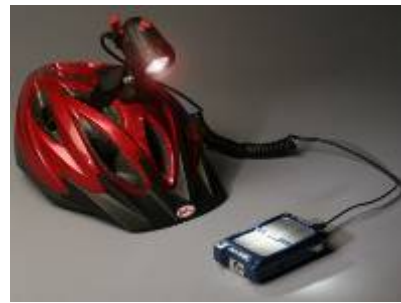
Examples of products available today using micro hydrogen™ fuel cells.

Shown here: security flashlights and portable micro hydrogen™ power packs (for search & rescue lighting, 2-way radios and range extension)