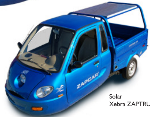
Solar Xebra ZAPTRUCK

Options/Accessories: Leather Seats, Fast Charger Solar Charger, Extended Range Battery