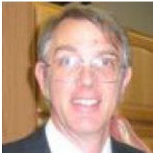
Bob Unruh for WND

Pizzagate connections to Hollywood and Silicon Valley