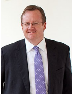
Gibbs in June 2010