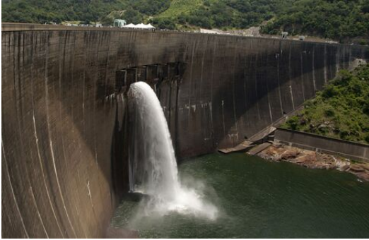
World's Biggest Dam Has 'Extremely Dangerous' Low Water Levels