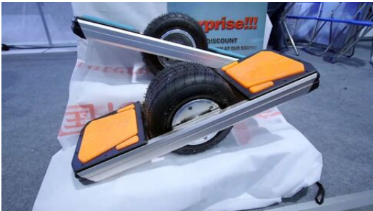
U.S. Marshals Raid Hoverboard Booth at CES