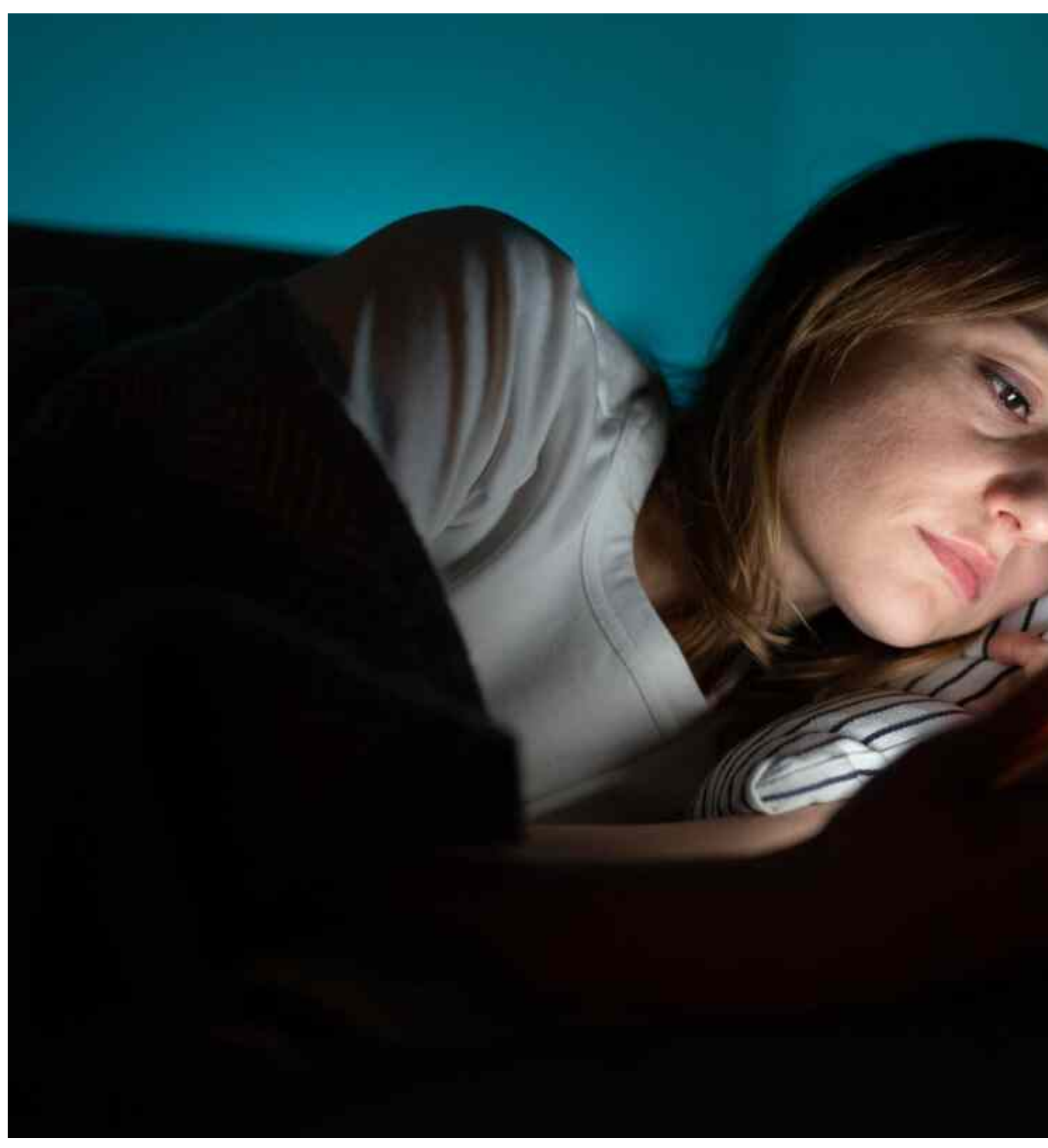
Being toyed with by a potential partner is especially damaging.