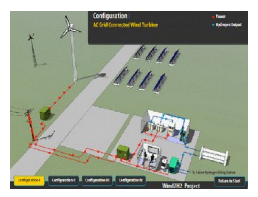
The entire supply and creation chain can be 100% clean