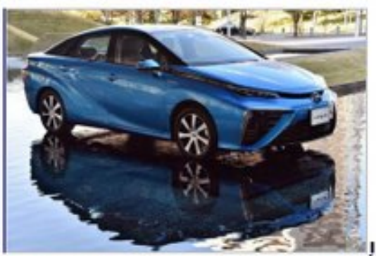
Inpanese auto giant Toyota Motor's hydrogen fael-cell whicle Mirai is displayed in Tokyo in November 2014

While most competitors are focusing on hybrids, with a heavy emphasis on battery-based models, Toyota remains skeptical about the long-term role of electric vehicle technology.